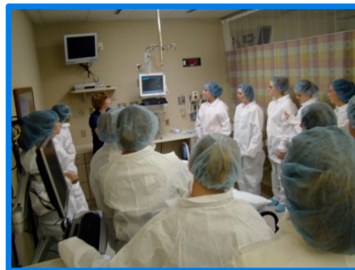
Sanford Youth Medical Explorers (YME) touring the Sanford Post Anesthesia Care Unit

Sanford Youth Medical Explorers (YME) is offering a summer program high school students, new graduates and undergrad students who are interested in exploring health careers. The Sanford YME program allows students to explore healthcare roles through tours and conversations with healthcare providers in the departments of the Sanford Medical Center in Sioux Falls. Dates: June 10,11,12, (1:00pm to 3:30pm) See link for application and information for the summer and school year program: https://www.sanfordhealth.org/student-programs